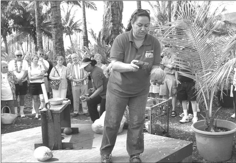
Cal Press members watch as coconut husking, which still must be done by hand, is demonstrated at the Maui Tropical Plantation.